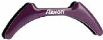
RANGE SILVER & GOLD