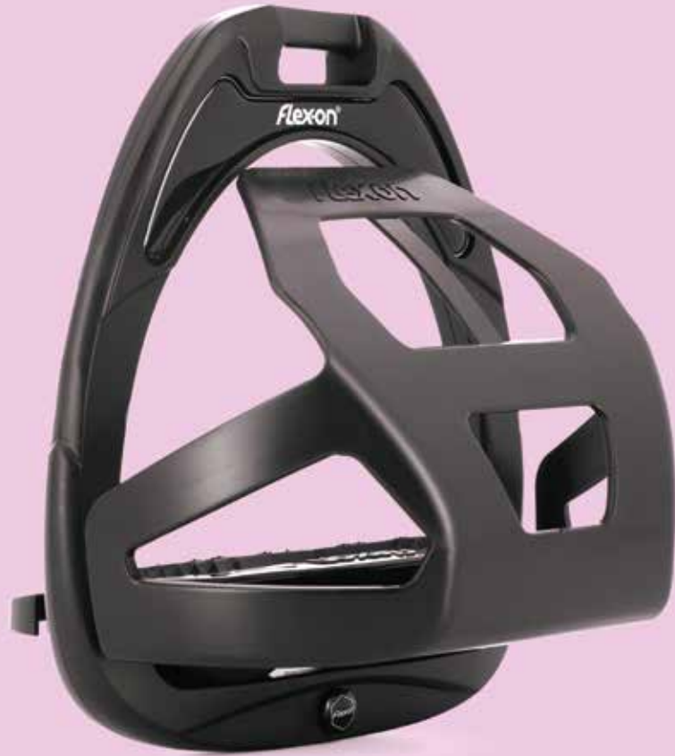
GREEN COMPOSITE JUNIOR STIRRUPS

The Green Composite Junior stirrup is designed for young beginner riders. It has the same characteristics as his big brother the Green Composite 2. Recommended for children under 40 kg, it comes with a cage to maximise comfort and safety.