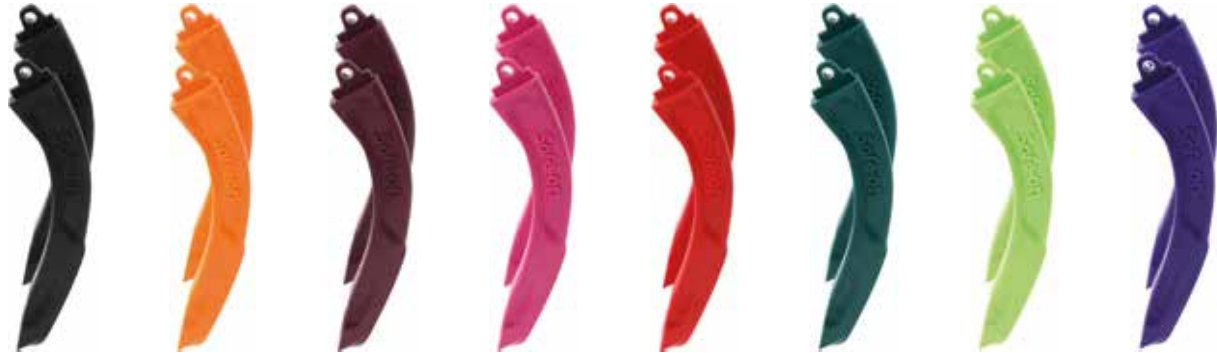
BROWN ORANGE PLUM PINK RED DARK GREEN GREEN PURPLE