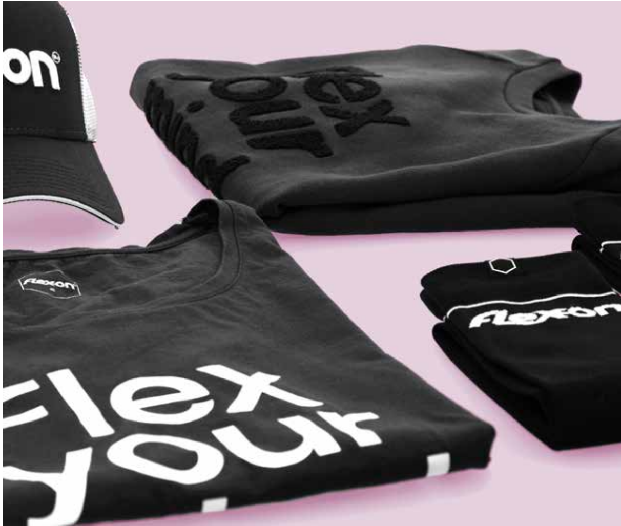
ACCESSORIES AND CLOTHING