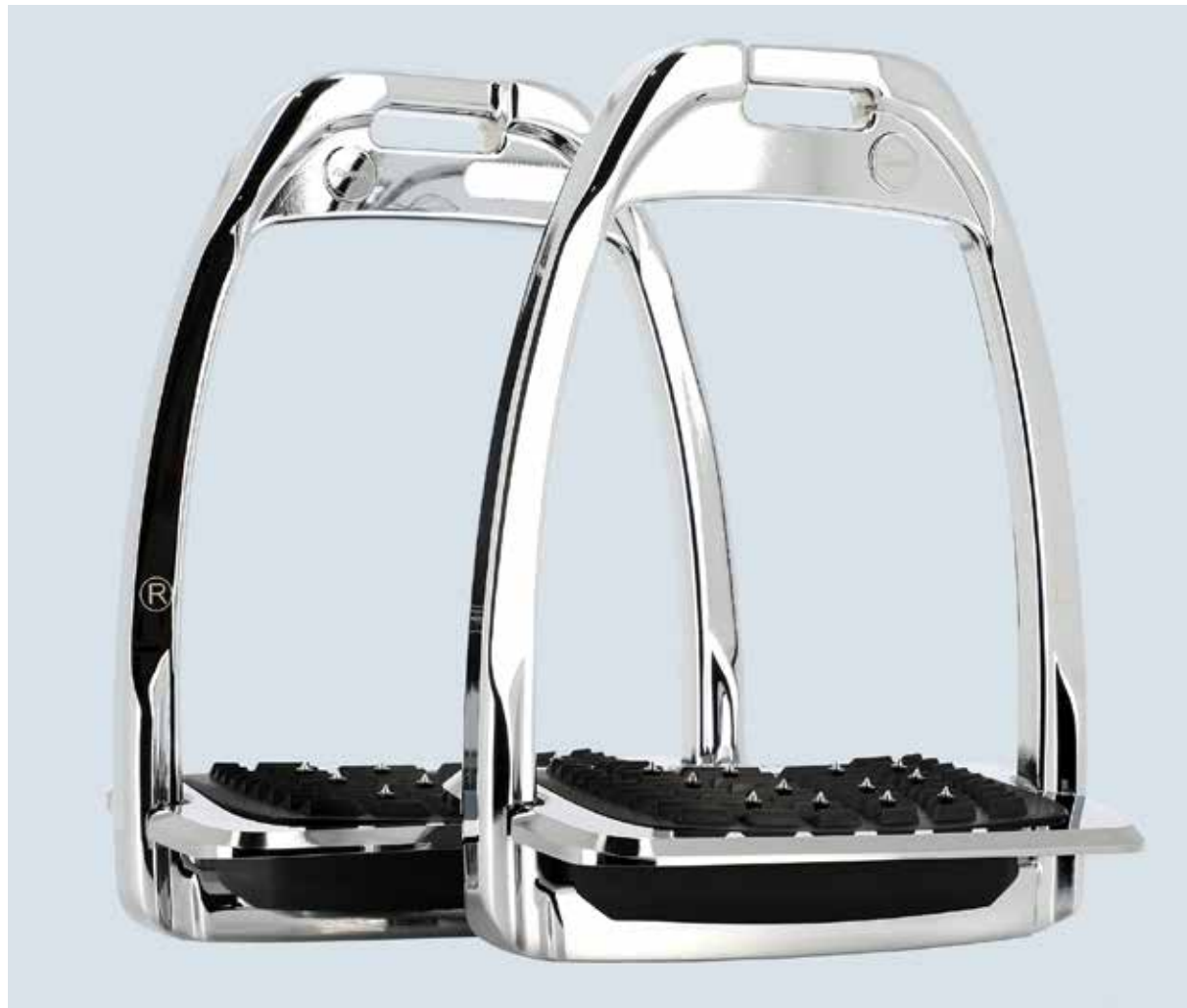
HUNTER H STIRRUPS

Hunter H stirrup has the same features as Hunter model. The “H” version is defined by a neo retro style with chrome iron. As solid as it is lightweight, it’s available with a flat or inclined tread, in grip or ultra grip inserts.