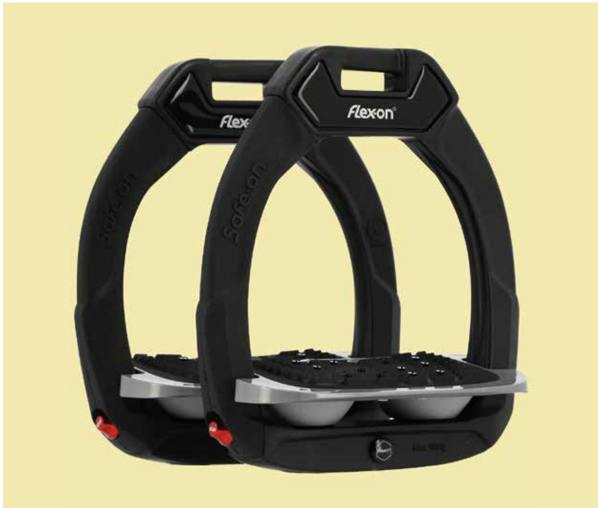
SAFE-ON JUNIOR STIRRUPS

The Safe-on Junior stirrup is designed for tomorrow's little champions !