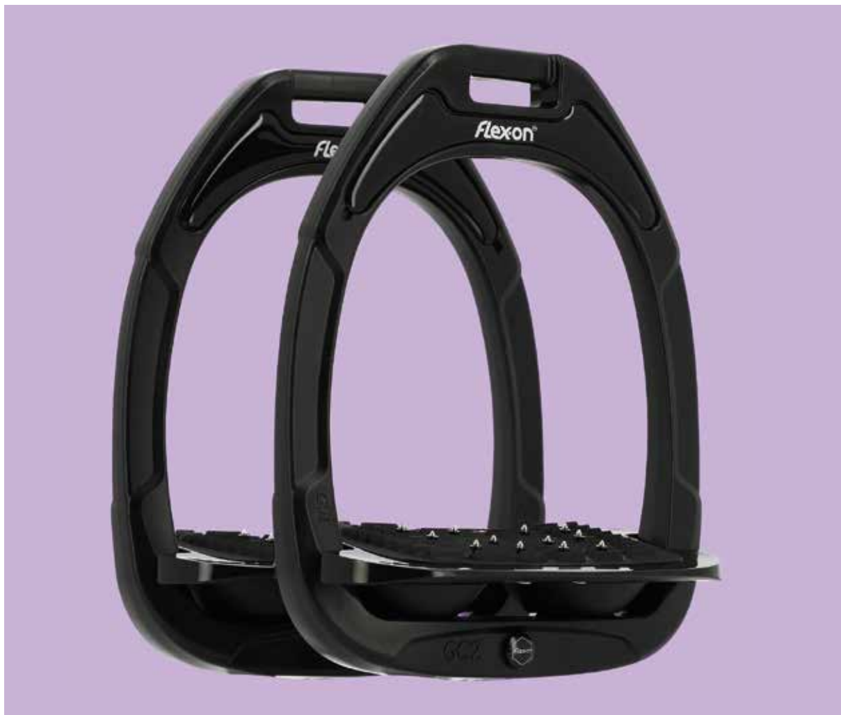
GREEN COMPOSITE STIRRUPS

Green Composite 2 combines comfort and performance .