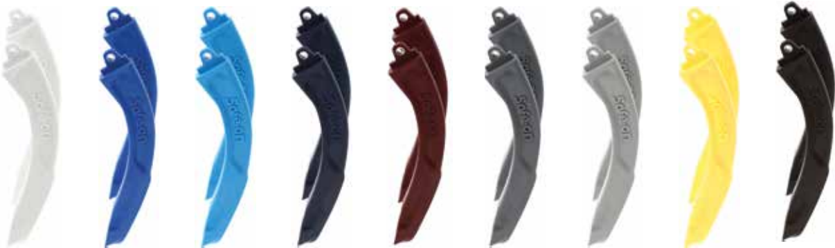
WHITE BLUE LIGHT BLUE NAVY BLUE BURGUNDY DARK GREY GREY YELLOW BLACK